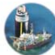
Umbilicals for energy, telecommunications, fluids and chemical transport