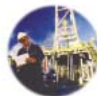
Topside instrumentation, compensation, control and power cables for continuous and reliable exploitation

Nexans supplied umbilicals fitted with CableSense to the Dutch dredging and marine contracting company, Van Oord.